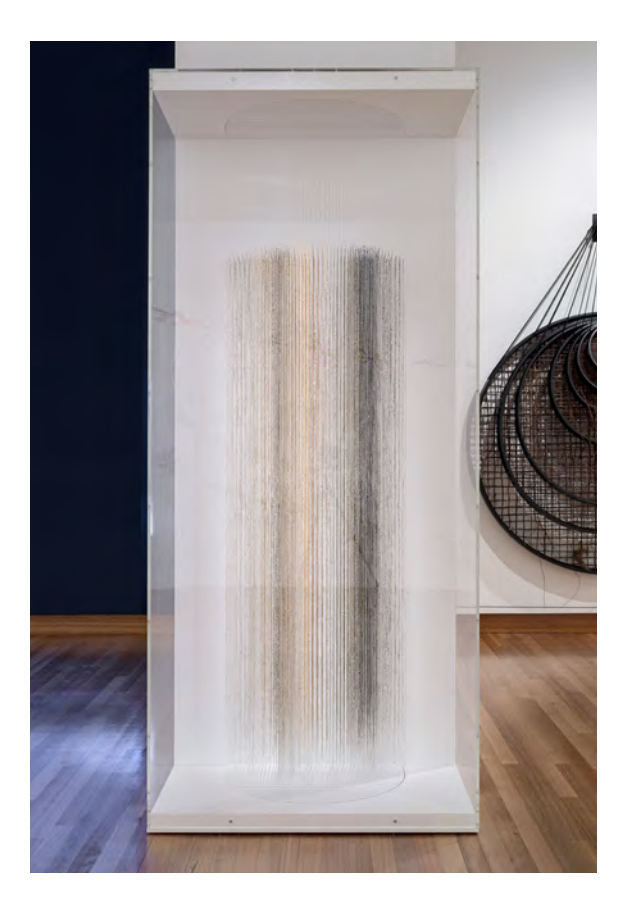
Melissa Macleod The Fall (#2) 2019–20 Nylon, steel, sand from 24 sites of erosion-prone New Zealand coasts Courtesy of the artist

Can you find the sand from New Brighton? Check the map to the right of the case to give you a clue.