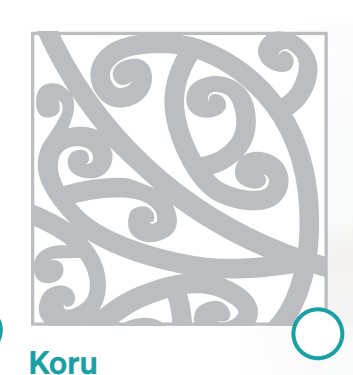
Spiral motif New life/beginnings, links to ancestors/genealogy