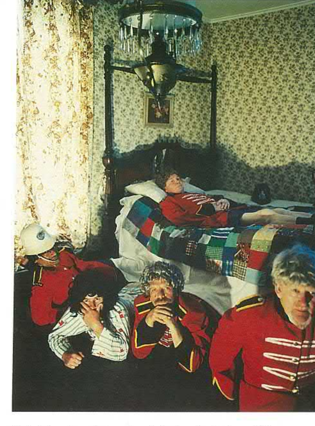
High Jinks, colour photograph and mixed media, 1360mm x 1030mm

Portraiture, colour photograph and mixed media, 1330mm x 1030mm Skittle, colour photograph and mixed media, 1700mm x 1025mm Domestic Duties, colour photograph and mixed media, 1030mm x 1330mm Embroidery, colour photograph and mixed media, 1030mm x 1350mm A Shooting Party, colour photograph and mixed media, 1020mm x 1340mm Riding Out, colour photograph and mixed media, 1030mm x 1470mm Nature Study, colour photograph and mixed media, 1030mm x 1370mm High Jinks, colour photograph and mixed media, 1360mm x 1030mm Fox Trot, colour photograph and mixed media, 1380mm x 1020mm Solitaire, colour photograph and mixed media, 1330mm x 1030mm Spinning, colour photograph and mixed media, 1000mm x 980mm Bird Watching, colour photograph and mixed media, 1025mm x 1250mm Hangman, colour photograph and mixed media, 1670mm x 1030mm