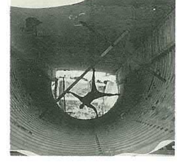
Spinning, colour photograph and mixed media, 1000mm x 980mm

Using established groups such as these is also an aid to creating the working relationships required for the construction of the image. Because there is an existing rapport amongst the group, it is a means towards establishing a unified dynamic for the camera.