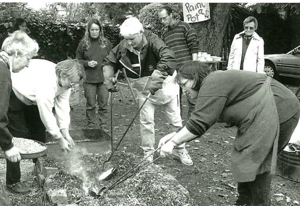
Playing with fire