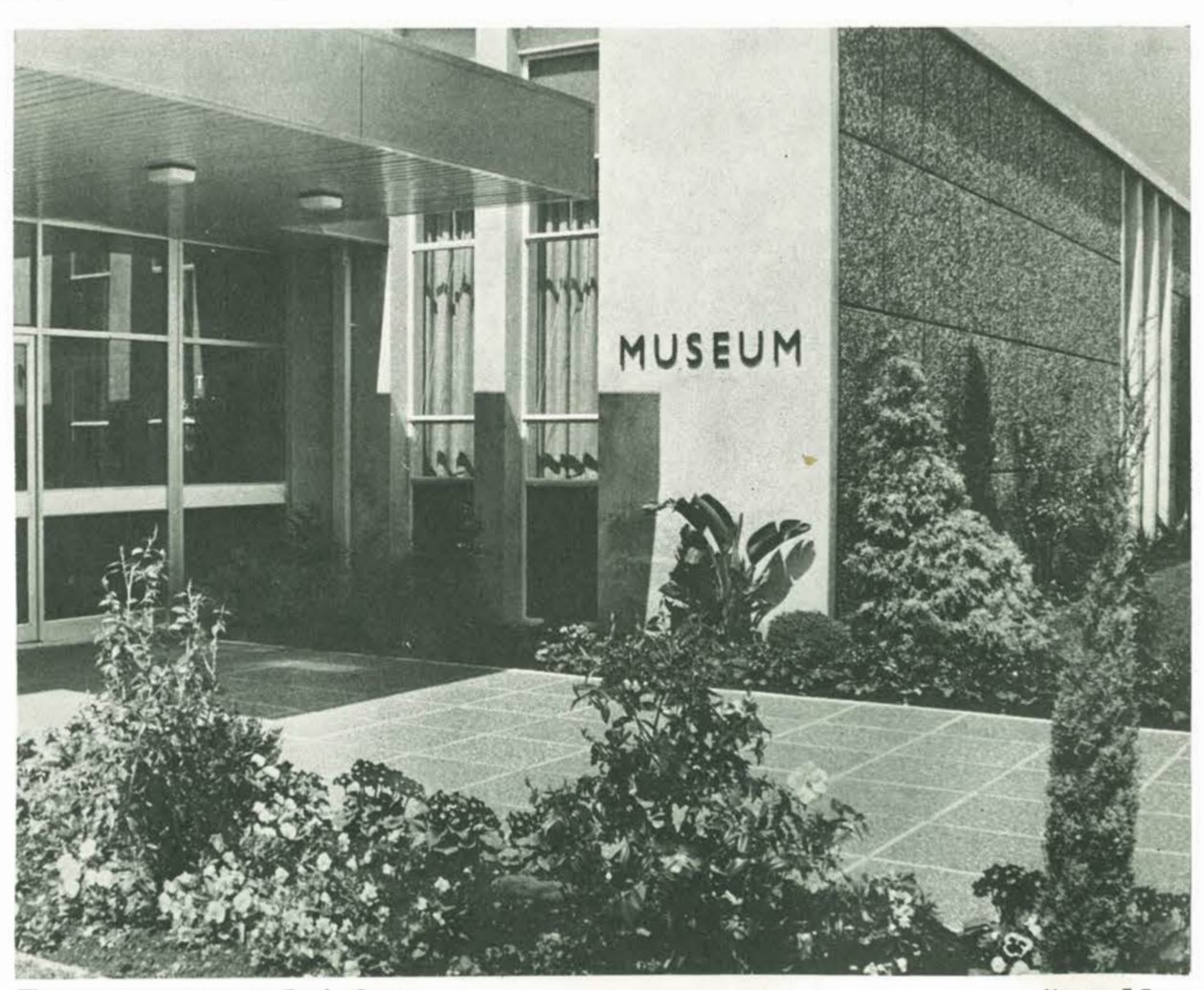
The museum entrance on Roche Street.

The Te Awamutu and District Museum is a local 'folk' museum with collections mainly related to Maori culture, Missions, Land Wars and the pioneer period of this district. However, as with other small museums, in its early years before a collection policy was formulated the tendency was to take in whatever was offered whether related to this district or not. Consequently there is a quantity of material in storage which one would not expect to find in a museum of this type.