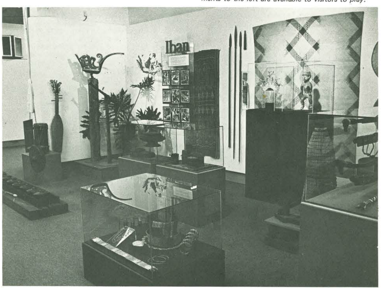
Waikato Art Museum - Kees Sprengers

The permanent Iban display. The gamelan instruments to the left are available to visitors to play.