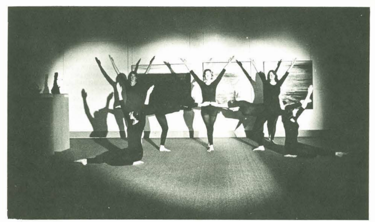
Modern dance group performing in the galleries during a permanent collection exhibition.