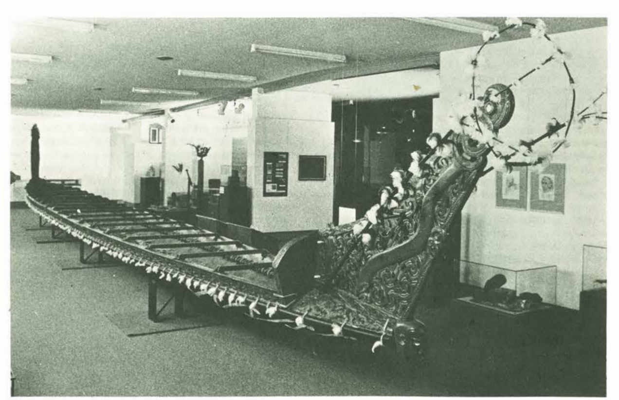
Te Winika at Waikato Art Museum

In all the art museum now has 8000 square feet (743 square metres) of display galleries and 6000 square feet (558 square metres) of other functions in the new building and the 2500 square feet (232 square metres) of the old art gallery is used as a store.