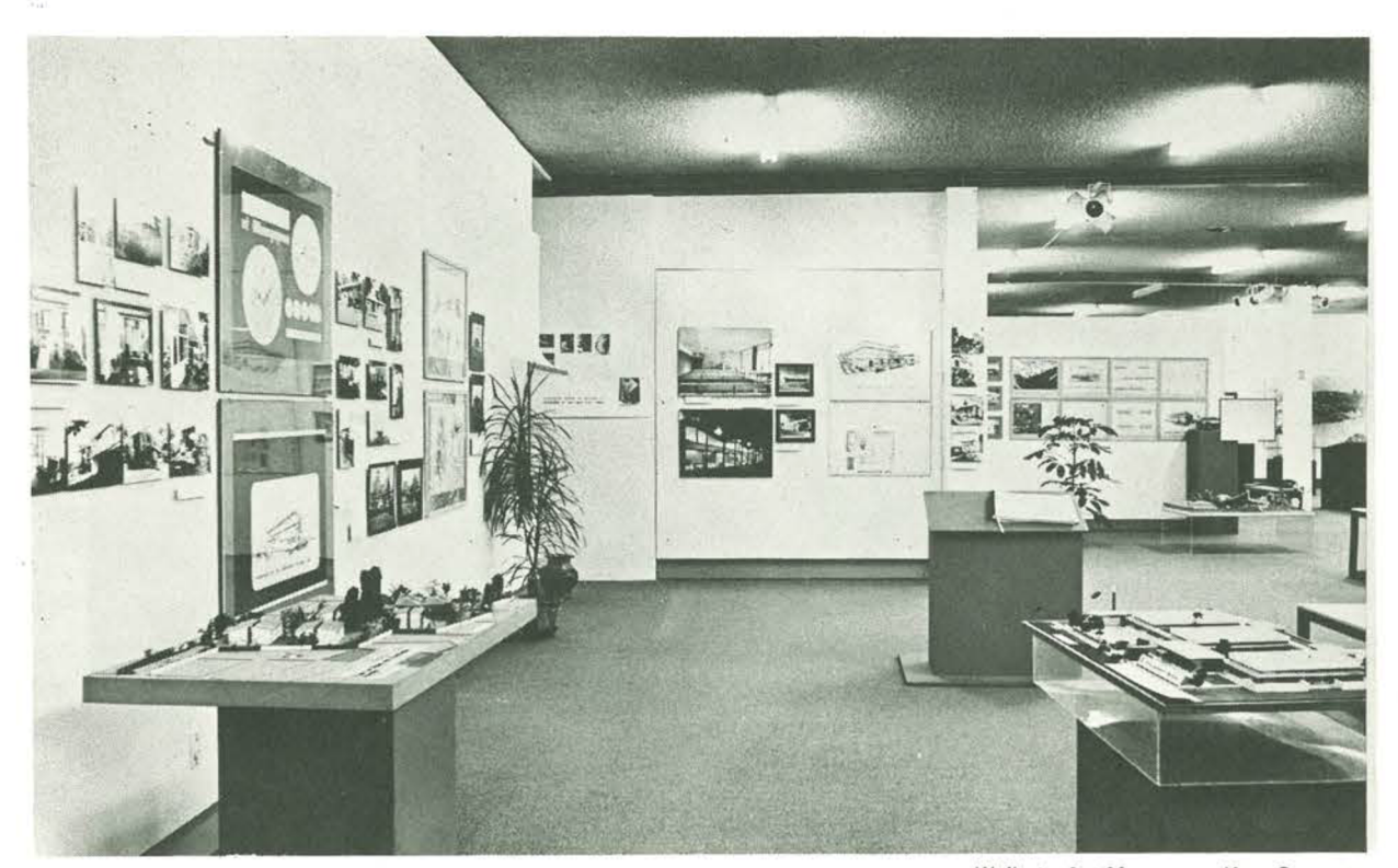
Waikato Art Museum — Kees Sprengers

A survey of the recent work of members of the Waikato-Bay of Plenty Branch of the New Zealand Institute of Architects, 1974.