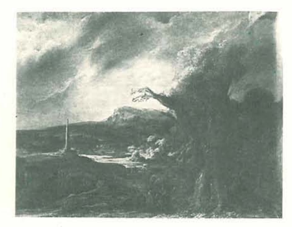
Rembrandt Landscape with an Obelisk. 548 × 713mm, painting, 1639

In landscape the use of different techniques for different approaches is certainly clearer. Rembrandt reserved the more realistic rendering of nature largely for his drawings and etchings, while the paintings are more subjective, imaginary and romantic with a rich play of chiaroscuro; dramatic thunderous skies, sudden shafts of light and fantastical rocky vistas.