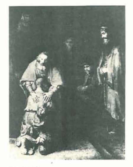
Rembrandt The Return of the Prodigal Son 2617 × 2051mm, painting, 1668/9

Rembrandt The Return of the Prodigal Son. 184 × 248mm, drawing, 1656-7