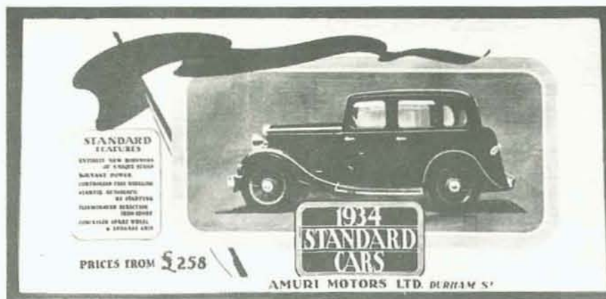
Billboard Design Standard Cars 1934.