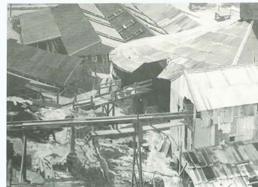
Hillside Brick Kiln 1936.