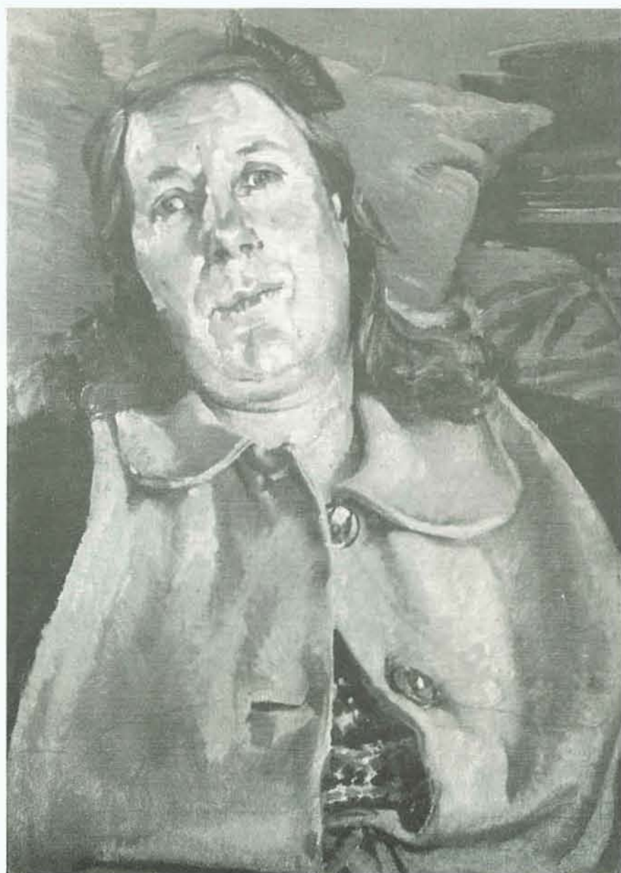
Portrait of the Artist's Wife 1947.