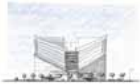
40 Stephenson and Turner