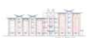
77 Charles R. Thomas Associates Ltd