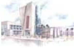
38 Stephenson and Turner