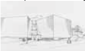
49 Kingston Morrison Ltd