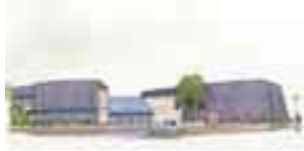
30 Architecture Warren and Mahoney