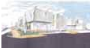
90 Cuba Architects and Inscape Design