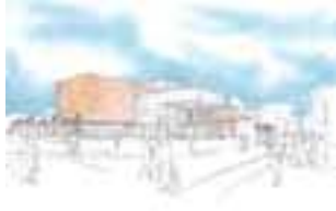
53 Sheppard and Rout Ltd