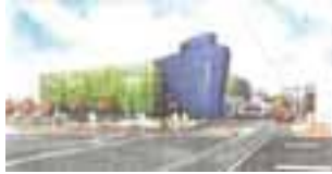
9 Wilson and Hill Architects