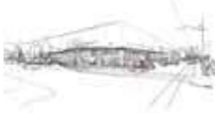
29 Boon Cox Goldsmith Jackson Ltd