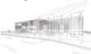
50 Barclay Architects/Peddle Thorp (no stage one entry found)