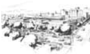
43 Patterson Co-Partners Architects Ltd with Barclay Architects Ltd