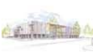
28 Boon Cox Goldsmith Jackson Ltd (incomplete drawings and practise capabilities missing)