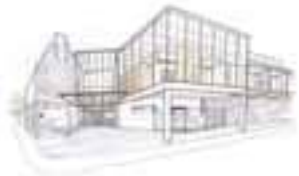
26 David McBride Architects