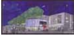
31 No entry found