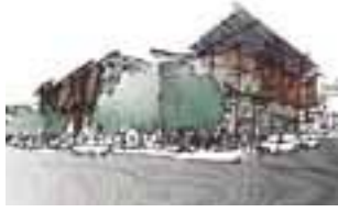
24 Suite 17