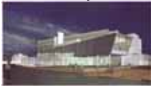
48 Simpson and Thornley