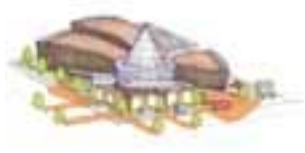
88 Studio Architecture/ Morris Bray Architecture