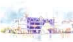
52 Dalman Architecture