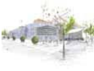
73 Pascoe Linton Sellars