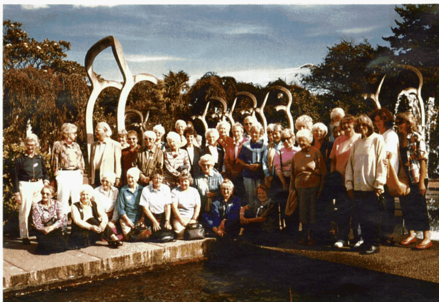
Friends on the April tour to the Masterpieces from the Guggenheim.