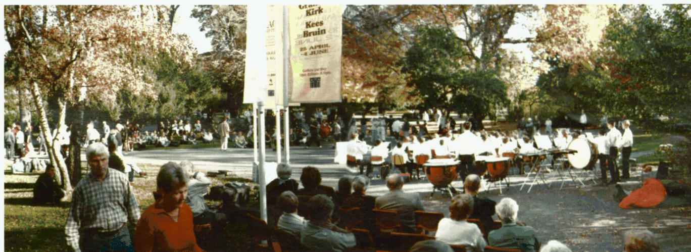
Christchurch Youth Symphonic Band during the 4 May concert at the front entrance to the Gallery.