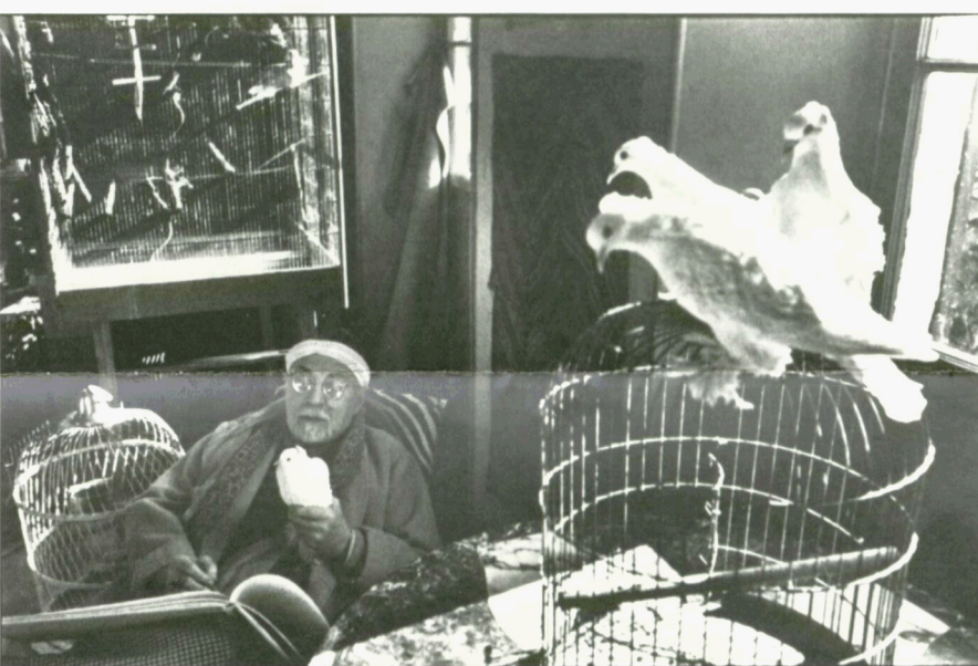
Henri Cartier-Bresson. Henri Matisse, Vence, France, 1944. Black and white photograph. 23-5/8 \times 30-3/8 \times 1-3/8 in.

Robert McDougall Art Gallery P.O. Box 2626 Christchurch Botanic Gardens Fax 653-942 Christchurch 1 Telephone 650-915