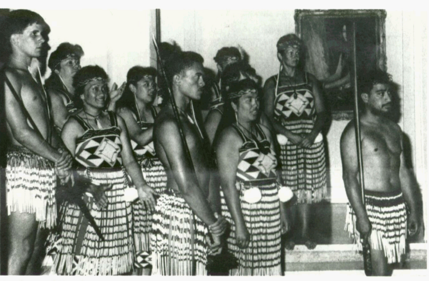
Members of Kotahitanga Culture Group at the opening of 'A Canterbury Perspective'.