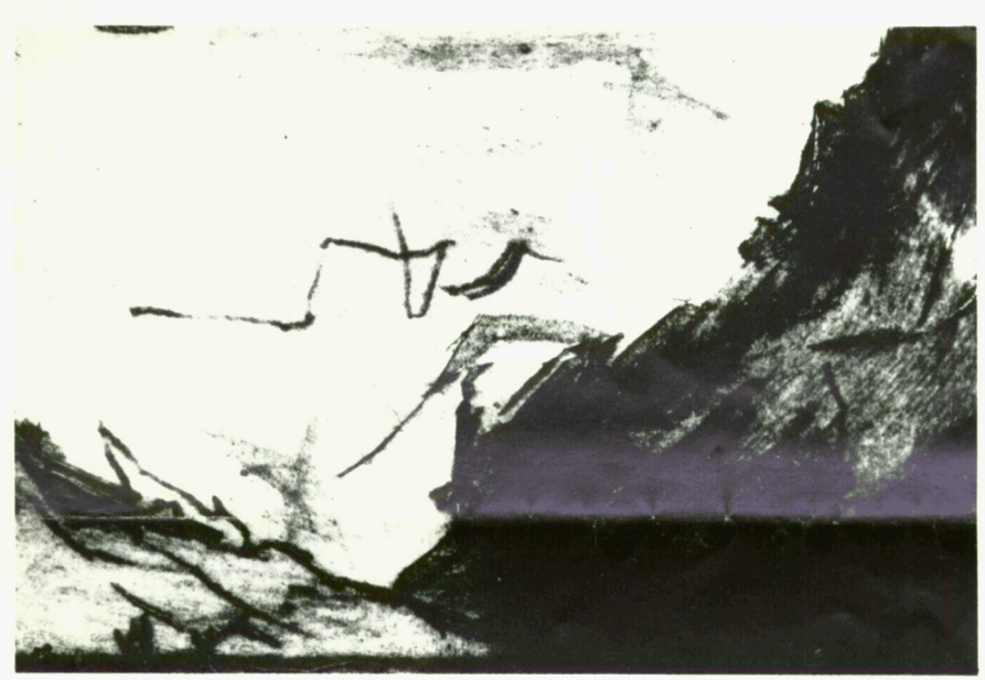
Sue Cooke, Ohau 1, edition of 30, 310x470mm