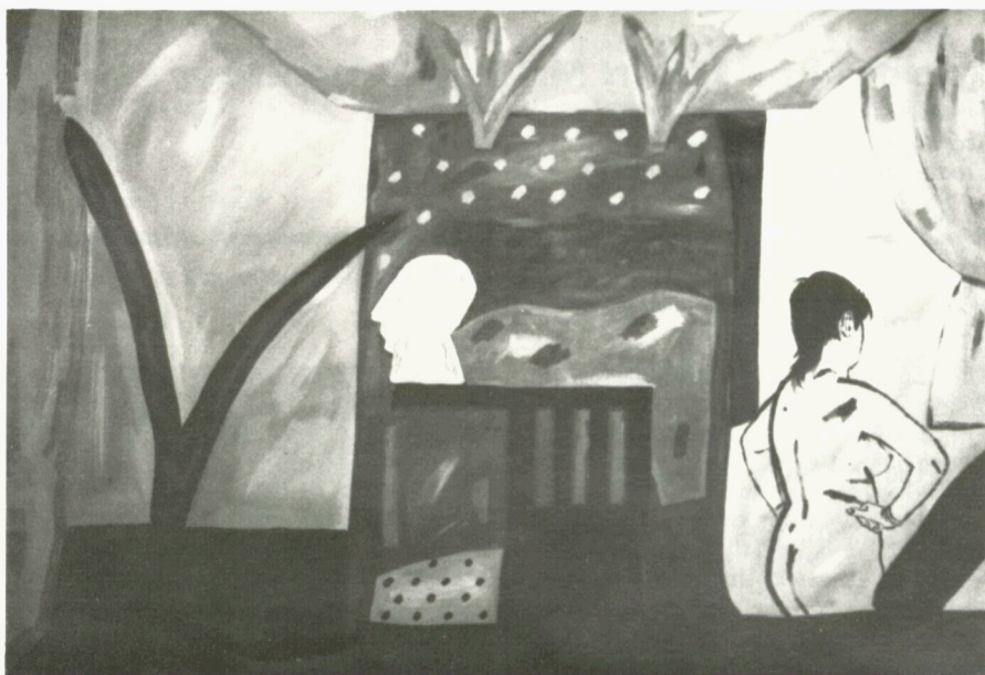
Jane Zusters, Post Modern Day Dream , Acrylic on Canvas (Detail).

The following works have been presented: