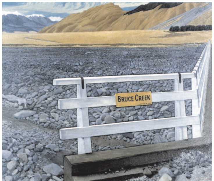
Dry September - W A Sutton (From The Collection at The Robert McDougall Art Gallery - one of the works destined for the new Art Gallery)

A secure solid fence (with peepholes so people will be able to view what's happening) will be built around the site and in January the artwork which was on the perimeter of the site will be mounted on the fence.