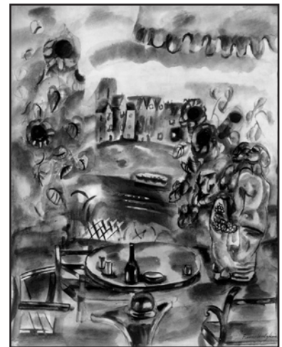
Frances Hodgkins The Pleasure Garden , 1933 Watercolour

The Robert McDougall Art Gallery was only large enough to show 8 -10 per cent of these works at any one time. This will increase to nearly 50 per cent at the new Gallery, and a series of temporary exhibitions over time will allow most of the collection to be displayed.